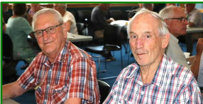
From a nearby Old Peoples Home

The images not shown in this picture, are of the women members who were present, but were busy organising things, arranging projects, getting ready for the meeting and preparing for Christmas.