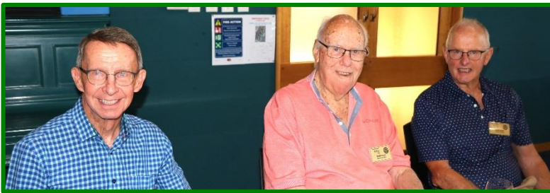
Acknowledging the "Birthday Boy"