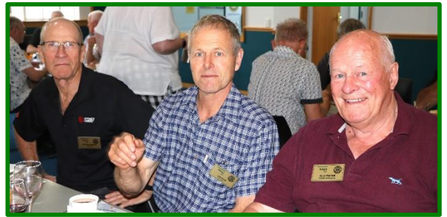
Getting Ready for the Speaker