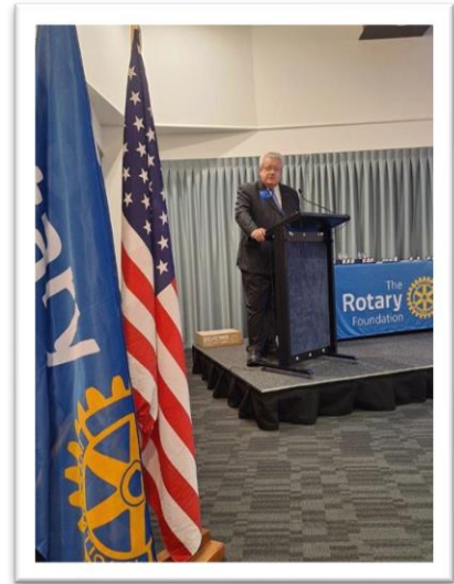
World Chair for The Rotary Foudation commences presenting awards to Rotarians from around the North Island