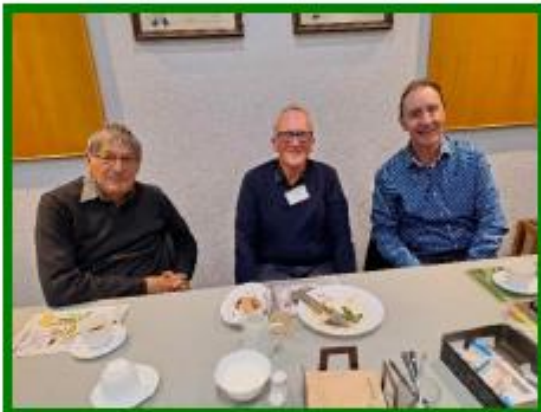
The Top Table tonight ↑ & their meal ↓