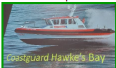
Coastguard Hawke's Bay