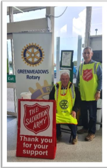
Two of our team members out there collecting for the Salvation Army's Annual Street Collection. (Ooops – must update the logo on the banner!)

Members were set the challenge at Rotary this week when told they could gain a free drink at the bar if they could guess who the two teenagers getting married sixty years ago were in this photo. A benevolent barmaid and his trusty assistant assisted with clues and everyone managed to get a drink.