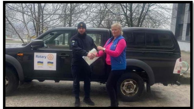
The Rotary Foundation