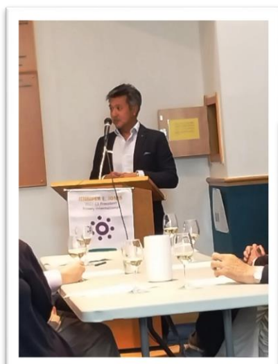
Left – the speaker Right & below – the preparation