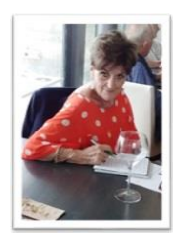
The view is superb and, the scribe is recorded as she records