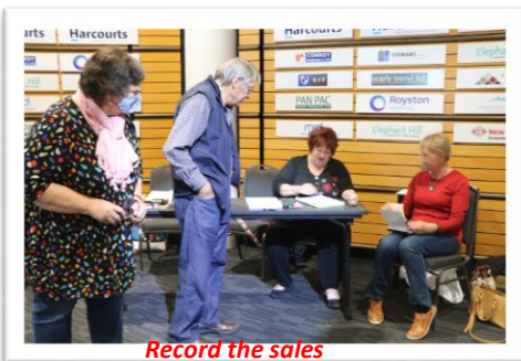
Record the sales