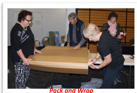
Pack and Wrap