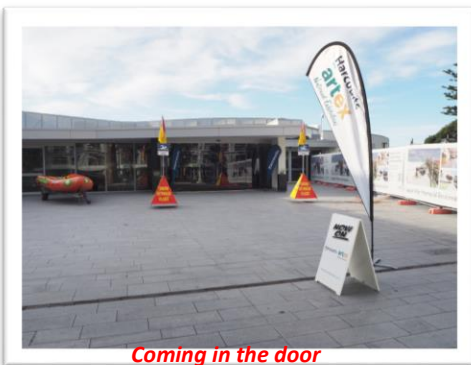
Coming in the door