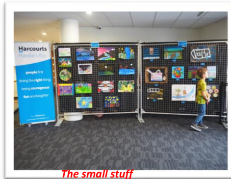
The small stuff