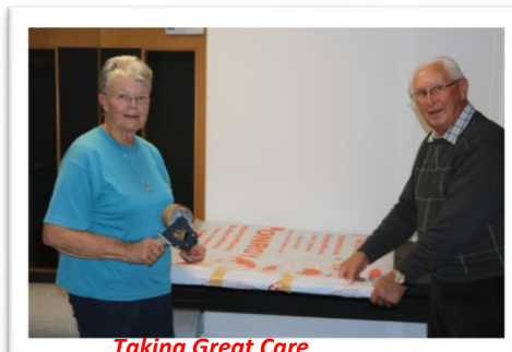
Taking Great Care