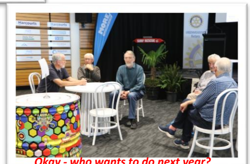
Okay - who wants to do next year?