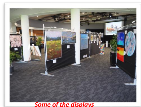
Some of the displays