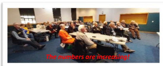
The numbers are increasing!