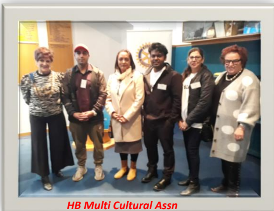
HB Multi Cultural Assn