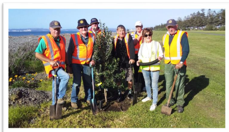
Some of our club members with their first tree

The five Rotary Clubs in Napier City combined recently to assist the City Council and as well do our part towards enhancing the environment. The "City" wanted some 50 Pohutukawa trees planted along the foreshore from the National Aquarium for about three kilometres to the industrial area at the south of the city boundary. The trees were said to cost about $50 each and holes had to be drilled for them and compost supplied.