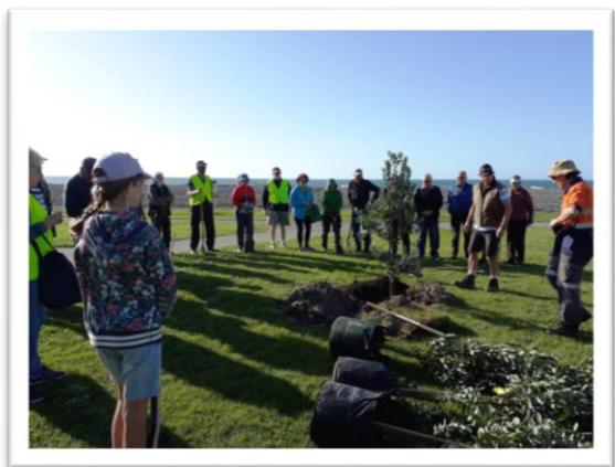
Members briefed on safety

Tree planting (missed from last week's report)