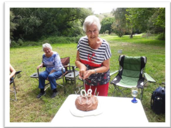
One guest celebrated her 80 th birthday - 12 months after it happened!

Here is where the brave men trod – with hoops and mallets!