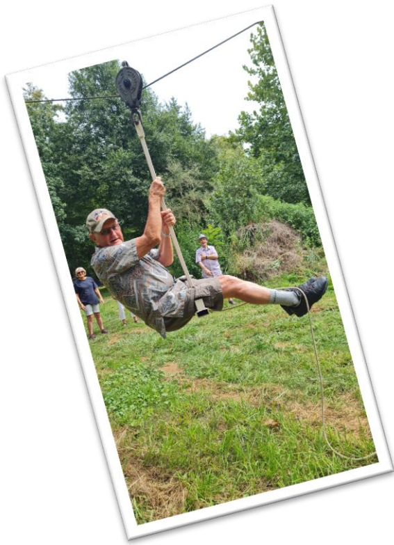
Angels soared where brave men feared to tread