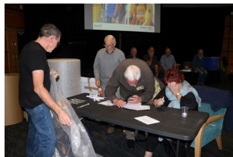
Note the supervisors in the background