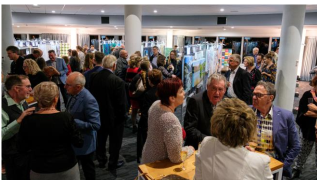
A great crowd at the soiree . . .