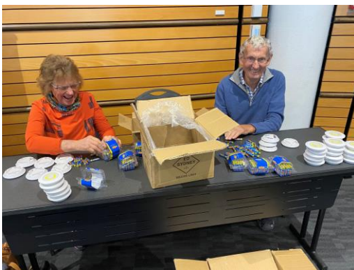
The lights won't work without batteries