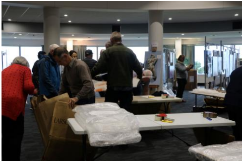
A hive of industry needs lots of worker bees