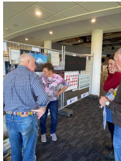
Are these pictures in the right order?