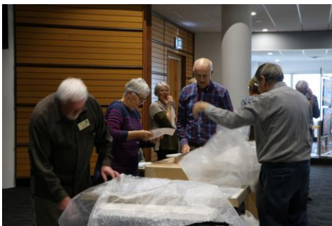
Packing up art is a science: the right process, the right materials and care to get the right result