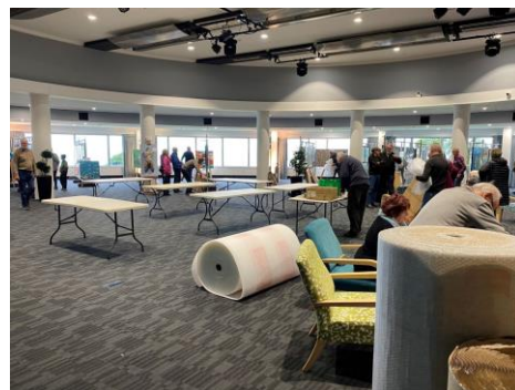
Many hands made light work (but it still took right up to 5:00 pm to get it all done)