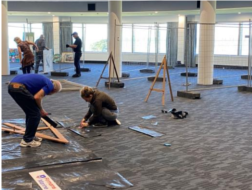
Achieving even without the assembly instructions