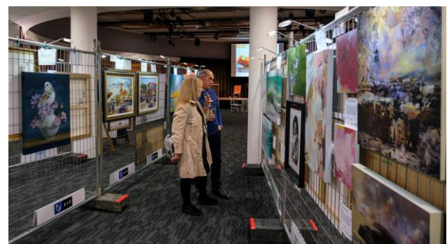
. . . but sometimes you need to get away from the others for a quality viewing