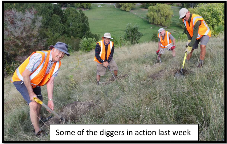
Some of the diggers in action last week

Anne acknowledged Greenmeadows Rotary’s generous donation 6 years ago to upgrade the trust mobile caravan including the large screen which is a key to taking advantage of ongoing software developments.