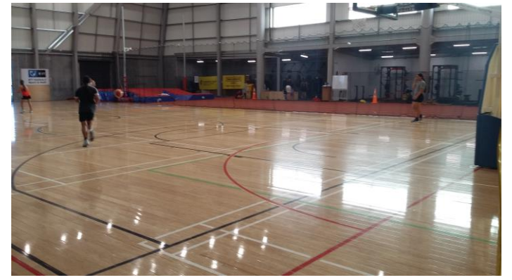
Figure 3 - The third basketball court in Health & Fitness Centre