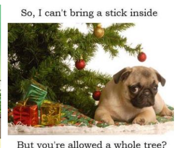
(A few 'left over' images from 2020)